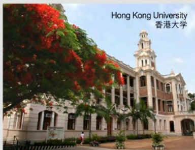
Hong Kong University 香港大学

● Where in Sai Ying Pun? 确切位置？ Centre Street, Second Street, Third Street, High Street, Bonham Road 西营盘正街、第二街、第三街、高街、般咸道