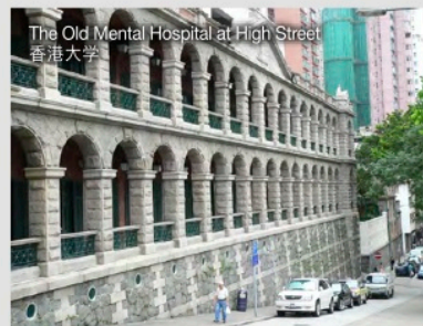
The Old Mental Hospital at High Street 香港大学