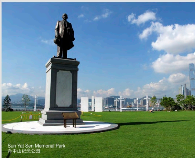
Sun Yat Sen Memorial Park 孙中山纪念公园